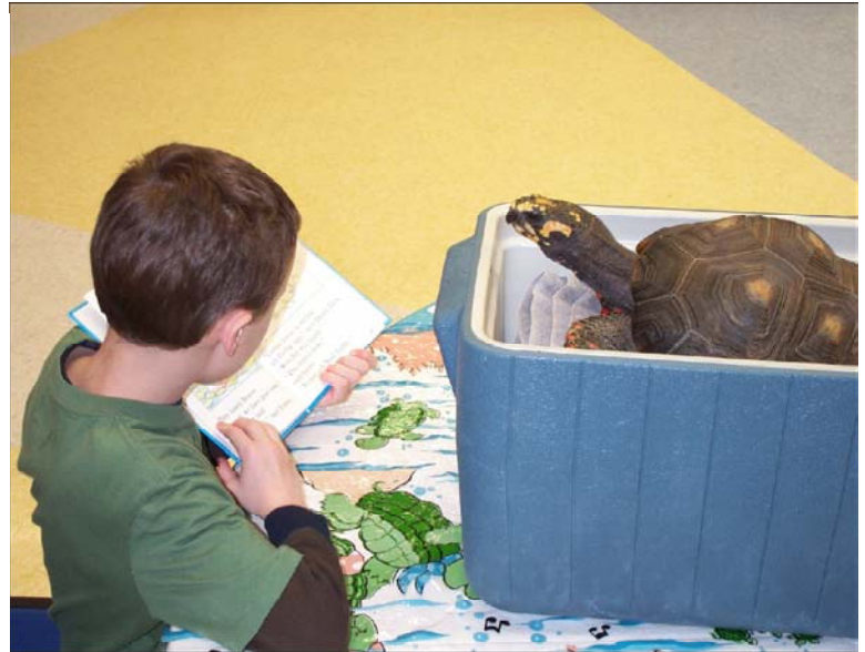
Above: an elementary school student reads a favorite book to Big Black Bart!

Here's how you can make reading more fun for your child: Children are invited to read a book to Turtlesinger Therapy Turtles! Children will have the opportunity with our "Read and Feed" program to read to and then feed Spike, a snapping turtle, Animal Hall of Fame winner Rocky, a box turtle, Gracie, a travancore tortoise, or blue ribbon winner Big Black Bart, a South American red-footed tortoise. Children are treated to readings with The Turtlesinger or The Turtletoter, with a different turtle simultaneously in each room if desired.